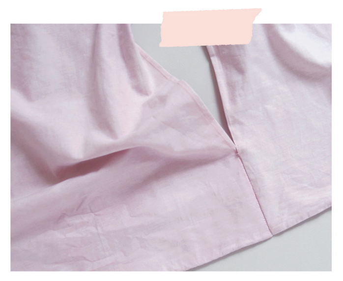
1. Start by assembling the 2 cushion covers by sewing the upper part on 10cm to make the shoulder straps. Cut 2 pieces of 40x70cm fabric to create the loincloth to be positioned in the lower part of the cushion.