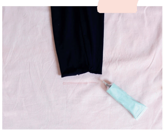
2. First glue the centre band, then the horizontal band by first gluing the sides to the back of the cushion, then glue the front part with the folds. Reinforce if necessary with small stitches.