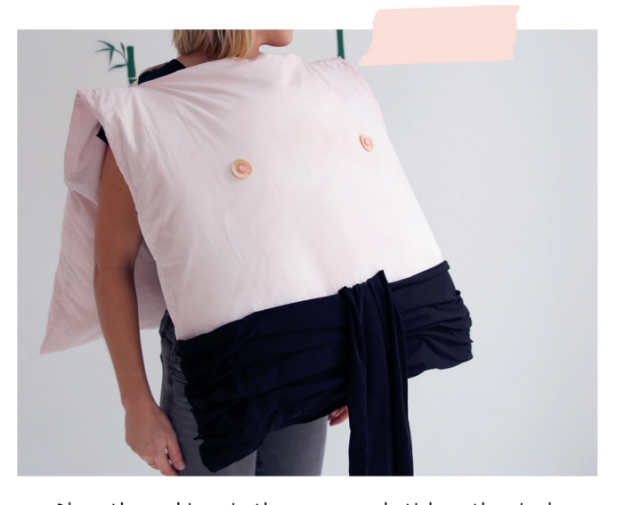
\ensuremath{\mathsf{3}}. Place the cushions in the covers and stick on the nipples.